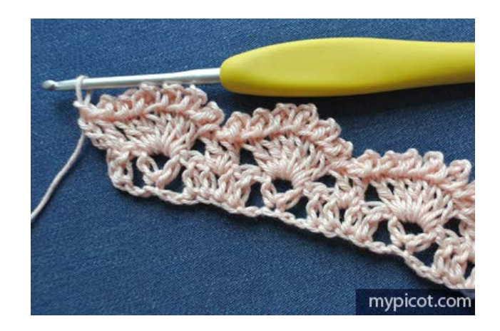
Row 3: 3ch, 1tr/dc in 2nd tr/dc below,

*skip 1st tr/dc of shell, work 1 BPtr/dc over each of the next 4tr/dc of the shell, 1tr/dc + 1ch + 1tr/dc in space of 1ch; rep from*,