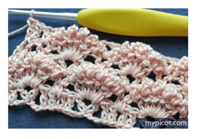
Repeat rows 2 - 5 until you have reached your desired length.

1tr/dc + 1ch + 1tr/dc in space of 1ch, 1tr/dc in tr/dc below, 1tr/dc in 3rd ch, turn.