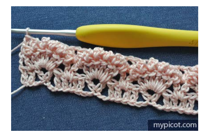
Row 4: 3ch, 1tr/dc in 2nd tr/dc below,

* work 1tr/dc + 1ch + 1tr/dc in space between 2nd and 3rd BPtr/dc below, work 6 times [1tr/dc + picot] in space of 1ch; rep from*,