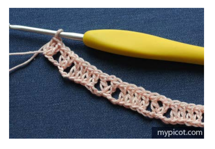
Row 2: 3ch, 1tr/dc in 2nd tr/dc below,

skip 2ch, 1tr/dc + 1ch + 1tr/dc in next, skip 2ch, 1tr/dc in each of the next 2ch, turn.