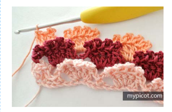
Repeat rows 2 - 5 until you have reached your desired length.

2ch, skip 2Pst, 1dc/sc in next Pst, 2ch, work 1tr/dc + 1pct in space of 4ch, 2tr/dc in same space, turn.