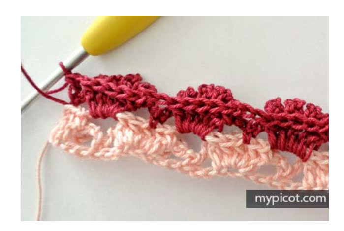
Row 5: Make 3ch, work 1tr/dc + 1pct in space of 1ch, 1tr/dc in same space,

1FPdc/sc over each of next 5tr/dc, 1ch, 1tr/dc in first ch, turn.