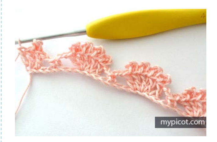
Row 2: Make 2ch, skip first st, 1FPdc/sc over each of next 2tr/dc below,

2ch, skip 2ch, 1dc/sc in next, 2ch, skip 2ch, 1tr/dc + 1pct in next, 2tr/dc in last ch, turn.