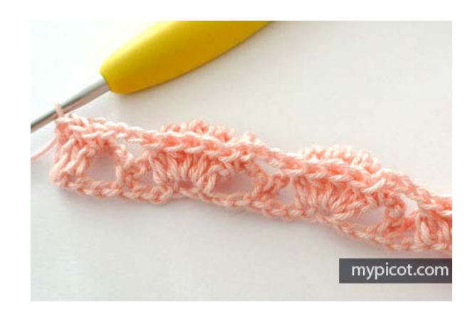
Row 3: Make 3ch,

3ch, 1FPdc/sc over each of next 2tr/dc below, 1dc/sc in third ch, turn.