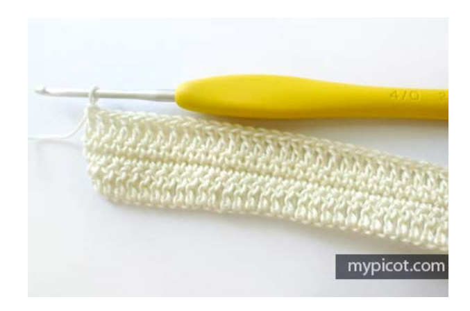
Row 5: Make 1ch, work 1dc/sc in each of next 5tr/dc below, * Make 2 leaves: 3ch,

Row 4: Make 3ch, skip first st, work 1tr/dc in each of next dc/sc below, turn.