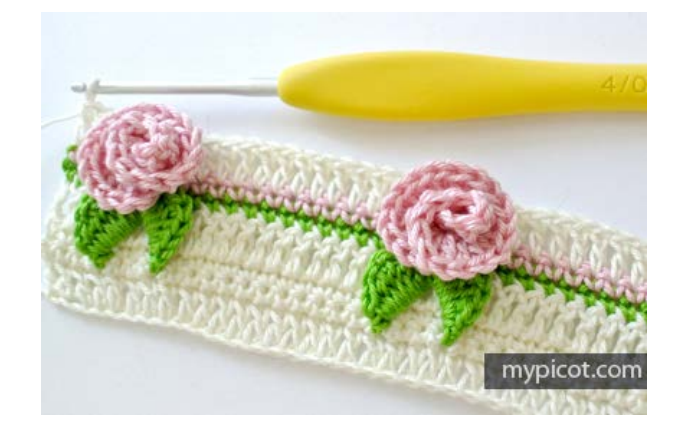
Row 8: Make 1ch, work 1dc/sc in each of next tr/dc below, 1dc/sc in third ch, turn.

Row 9: Make 1ch, work 1dc/sc in each of next dc/sc below, turn.