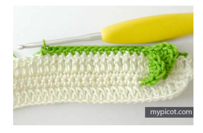
Make 2 leaves, work 1dc/sc in each of next 4tr/dc, 1dc/sc in third ch, turn.