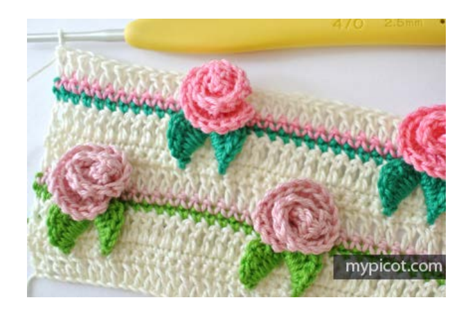
Repeat rows 2 – 13 until you have reached your desired length.