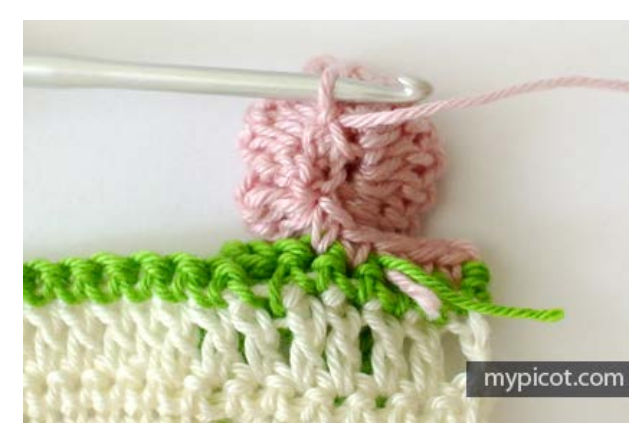
Drop loop from your hook and rotate rosebud one time clockwise.

Grab dropped loop and <u>continue work row:</u>