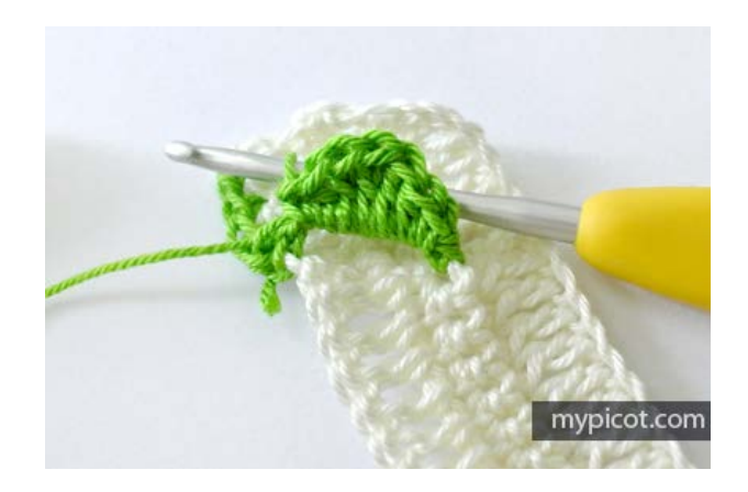
Make 3 ch, skip 2st back from first leaf, insert your hook from back to front into next tr/dc of Row 1 (of Row 13), work 1dc/sc.