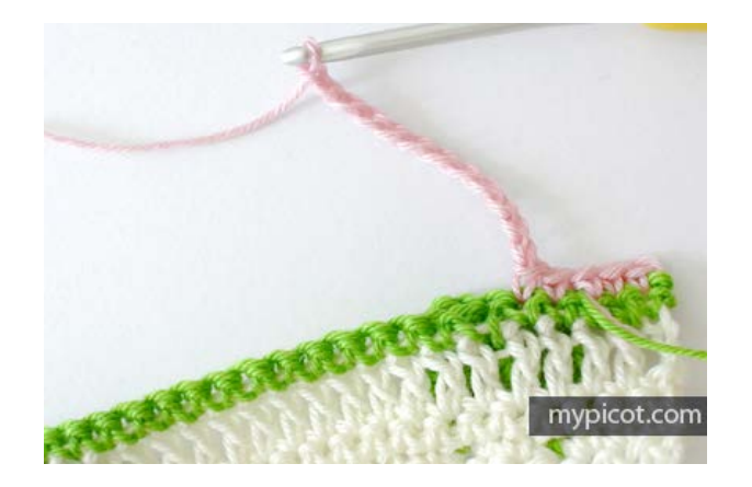
skip 3ch, work 3tr/dc in each of next 9ch, 3ch, slt in last ch,