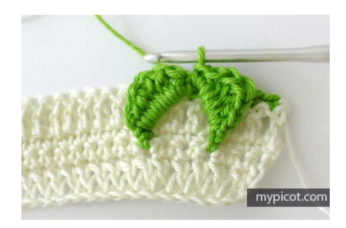
<u>Continue work row:</u> make 1dc/sc in each of next 15tr/dc below; rep from *.