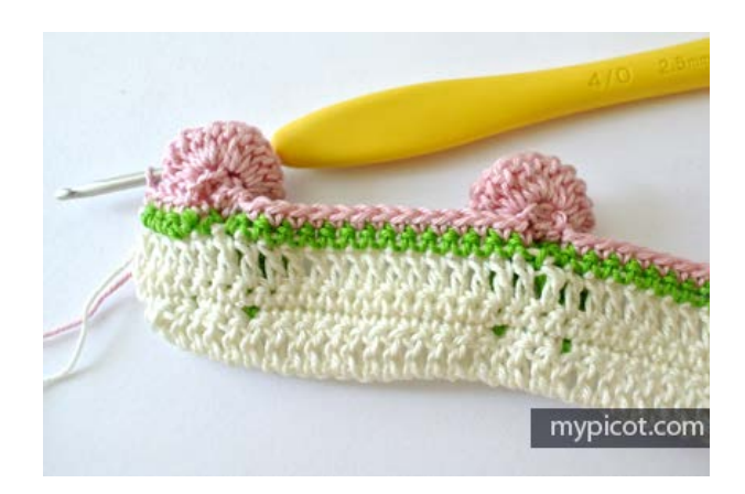
Row 7: Make 3ch, skip first st, work 1tr/dc in each of next dc/sc below, turn.

work rosebud, 1dc/sc in each of next 5dc/sc below, turn.