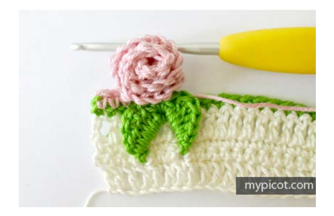
Insert your hook through bottom side of rose and sew all layers of flower making slt.

Make this step one more time. Work 1ch and turn.