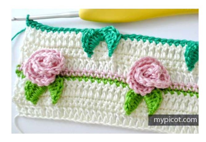
Row 12: Make 1ch, work 1dc/sc in each of next 13dc/sc below,

work 2 leaves, 1dc/sc in each of next 12tr/dc below, 1dc/sc in third ch, turn.