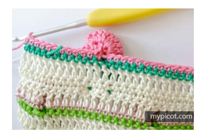
Row 13 : Make 3ch, skip first st, work 1tr/dc in each of next dc/sc below, turn.