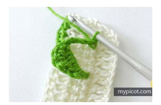
Make 1dc/sc + 1htr/hdc + 3tr/dc + 1htr/hdc + 1dc/sc in space of 3ch.