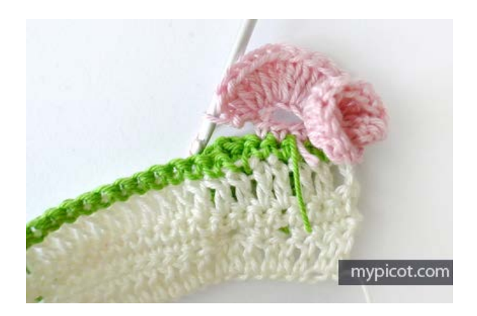
Turn and roll spiral together from one end, rolling towards the other end. Form strip together into a rosebud shape.