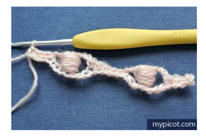
Row 2: 2ch, 1dc/sc in each of next 3 dc/sc below,

* 3dc/sc in 1st space of 3ch, 1dc/sc in tr/dc, 3dc/sc in 2nd space of 3ch, 1dc/sc in each of next 5 dc/sc below; rep from*,