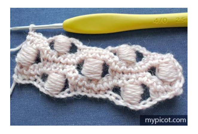
Repeat rows 2 - 5 until you have reached your desired length.

skip 3 st, 1tr/dc in next, make puff.st over previous tr/dc, 3ch, skip 3 st, 1dc/sc in each of next 3 dc/sc below, 1dc/sc in 2nd ch, turn.