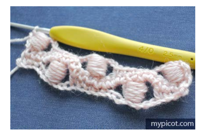
Row 4: 2ch, * 1dc/sc in next tr/dc, 3dc/sc in space of 3ch, 1dc/sc in each of next 5 dc/sc below, 3dc/sc in space of 3ch; rep from*, 1dc/sc in tr/dc, 1dc/sc in 3rd ch, turn.

Row 3: 3ch, 1tr/dc in next st, puff.st over previous tr/dc, *3ch, skip 3 st, 1dc/sc in each of next 5 dc/sc below, 3ch, skip 3 st, 1 tr/dc in next, puff.st over previous tr/dc; rep from *, 1tr/dc in 2nd ch, turn.