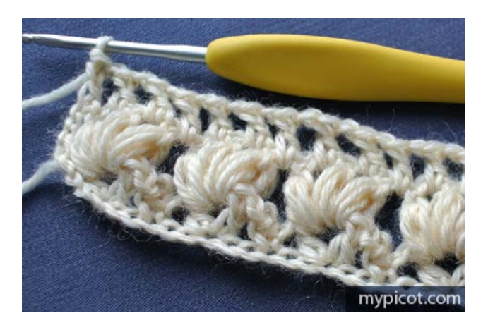
Row 4: 3ch, * 1tr/dc in space of 1ch, 1tr/dc in tr/dc below; rep from*,

1tr/dc in space of 2ch, 1ch, 1tr/dc in next space of 2ch, 1ch, 1 tr/dc in 3rd ch, turn.