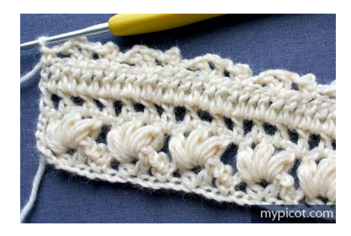
Repeat rows 2 - 5 until you have reached your desired length.