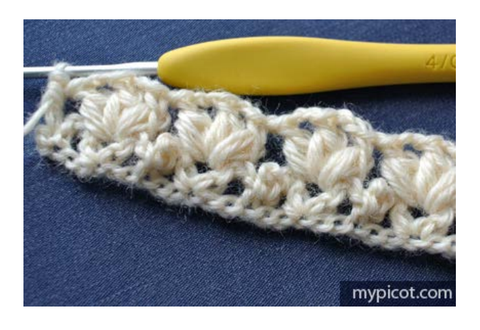
Row 3: 4 ch, * 1tr/dc in space of 2ch, 1ch, 1tr/dc in next space of 2ch, 1ch, 1 tr/dc in space of 1ch, 1ch; rep from*,

1 puff.st + 2ch + 1 puff.st + 2ch + 1 puff.st in space of 2ch, 1tr/dc in dc/sc below, turn.