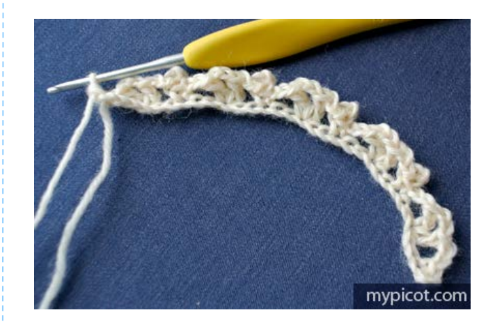
Row 2: 4ch,

* work 1 puff.st + 2ch + 1 puff.st + 2ch + 1 puff.st in space of 2ch, 1ch; rep from*,