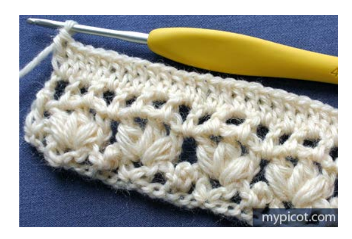
Row 5: 1ch, * 1dc/sc in st below, 1 picot, 2ch, skip 2 st, 1tr/dc + 2ch + 1tr/dc in next st, 2ch, skip 2 st; rep from *,