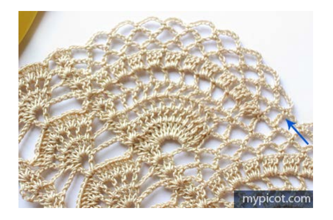
For Part 2 repeat rows 11 – 20.

Part 2 7ch, * 1dc/sc in space of 6ch, 7ch; rep from* 7times, 1 dc/sc in space of 6ch, 4ch. Turn.