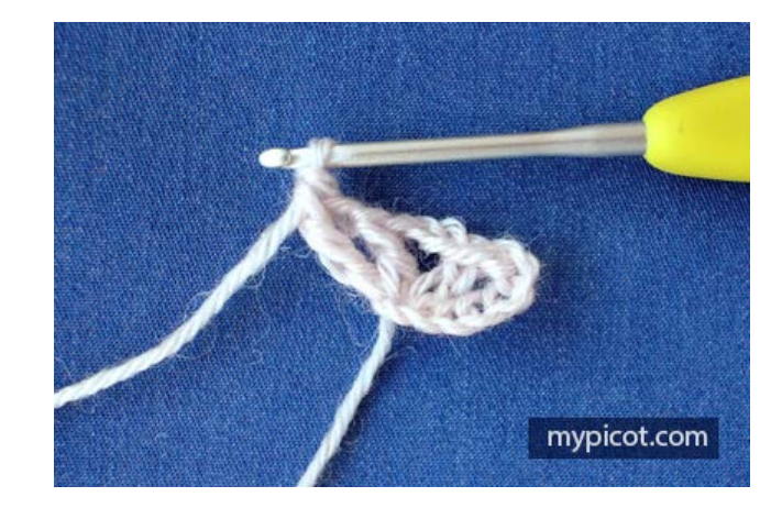
Row 2: 1ch, 1 dc/sc in d.tr/tr below, 7 tr/dc In space of 1 ch, 1 dc/sc in space of 3 ch, 7 tr/dc in next space of 6 ch, 1 dc/sc in second of 6 ch, turn.

Row 1: 6 ch, 1 tr/dc in last ch, 3 ch, 1 tr/dc in the same ch, 1 ch, 1 d.tr/tr in the same ch, turn.