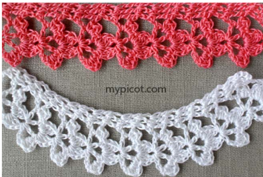
Curved line edging.